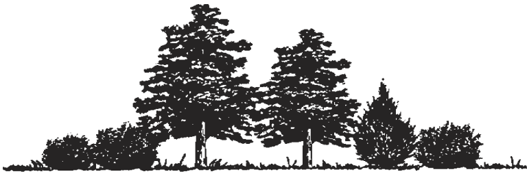
Figure 2: Ladder fuels enable fire to travel from the ground surface into shrubs and then into the tree canopy.

variety of textures and color and help reduce soil erosion. Consider ground cover plants for areas where access for mowing or other maintenance is difficult, on steep slopes and on hot, dry exposures.